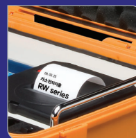
Built in printer