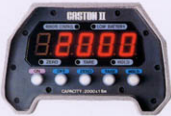
▲ Display & Key board