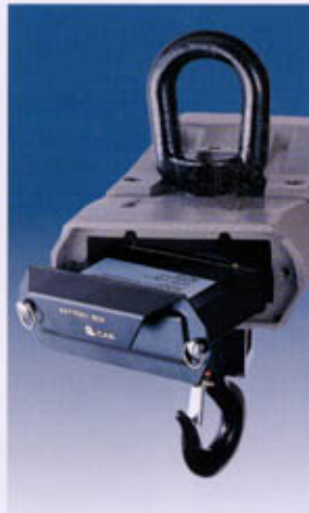
▶ Battery Pack Installation